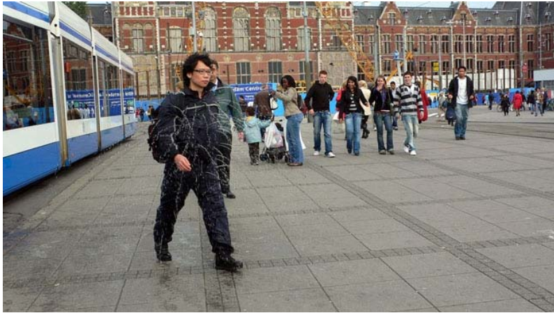
Invisible City: Sealevel Leaker, 2006, 01'40'', action video