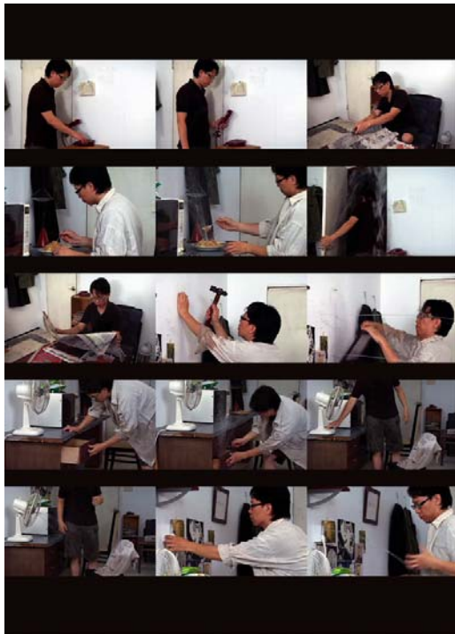
Invisible City: Amstel 88 III, 2006, 01'46, action video